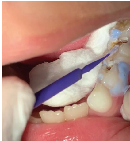
Figure 6 Application of 2 drops of Riva Star Step 2 (KI)

After waiting for 60 seconds, apply the potassium iodide (Riva Star Step 2) with a new point, in a thin layer, repeating this process up to 5 times if necessary, to reduce the tooth's darkening effect (Figure 5 and 6). Remove the excess with absorbent paper and dry or clean abundantly in case the restoration has to be made in the same session.