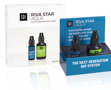
Figure 2 Riva Star Aqua [AgF]