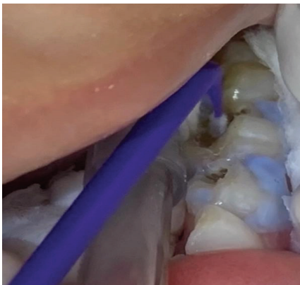
Figure 4 Product applied on tooth

Apply 1 drop of Riva Star Aqua (Step 1) with a point rubbing on teeth 74 and 75. Wait for 60 seconds (Figure 3 and 4).