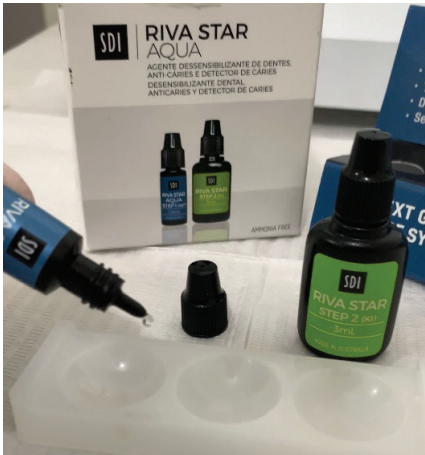
Figure 3 Application of 1 drop of Riva Star Aqua Step 1

After prior cleaning, protecting the soft tissues with Vaseline and relative insulation with cotton. Note: Although Gingival protection is applied here, it is not necessary as there is no Ammonia in Riva Star Aqua that will irritate soft tissues.