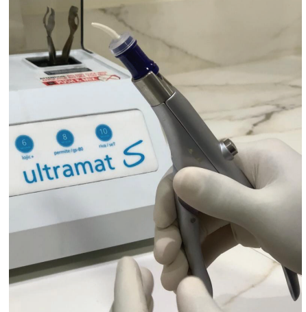
Figure 8 Handling of Riva Self Cure

Post verification of lesion halt, proceed to restoring of teeth 74 and 74 using Riva Self Cure.