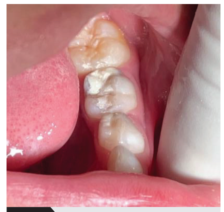
Figure 10 After treatment with Riva Star Aqua and Restoring with Riva Self Cure (GIC)