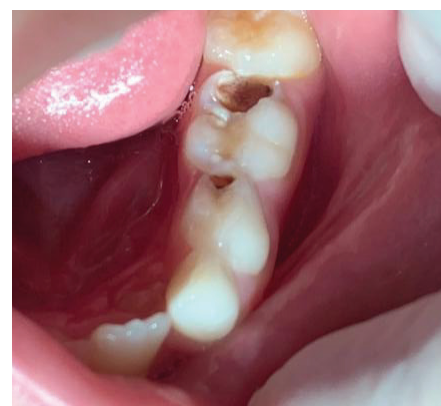
Figure 1 Prior to treatment

The physical exams found that molars 74 and 75 had active carious lesions with no pulp compromise ( Figure 1 ). A treatment was planned with the family using SDI's cariostatic agent Riva Star Aqua [AgF] ( Figure 2 ). The procedure was explained to the parents, including its benefits and an informed consent agreement was signed.