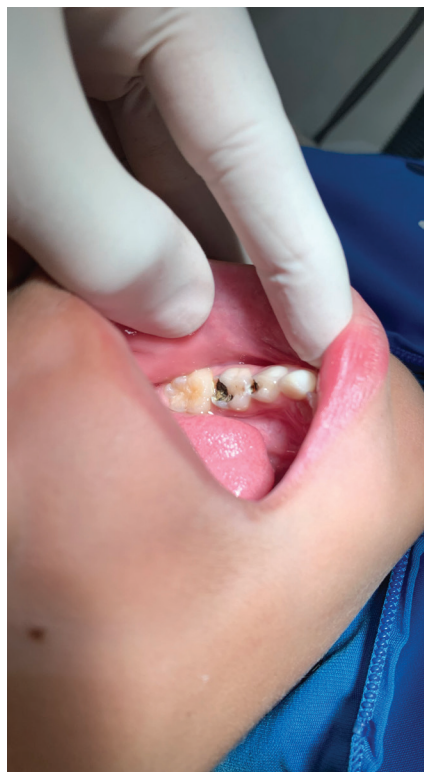
Figure 7 Results after 7 days' application and lesion halt.

Post verification of lesion halt, proceed to restoring of teeth 74 and 74 using Riva Self Cure.