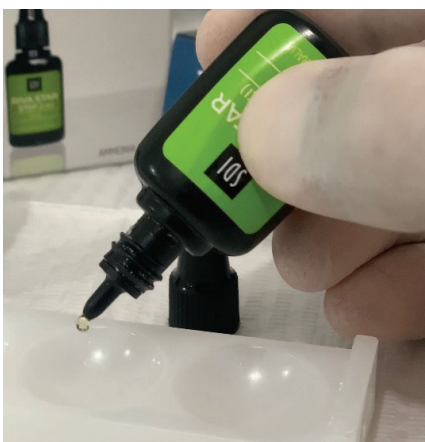
Figure 5 Riva Star Step 2 - Potassium Iodide (KI)

After waiting for 60 seconds, apply the potassium iodide (Riva Star Step 2) with a new point, in a thin layer, repeating this process up to 5 times if necessary, to reduce the tooth's darkening effect (Figure 5 and 6). Remove the excess with absorbent paper and dry or clean abundantly in case the restoration has to be made in the same session.