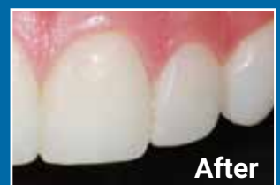
Dr Hugh Flax (USA)