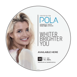
POLA WINDOW STICKER Reorder M100289