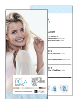
POLA MENU Reorder M100292