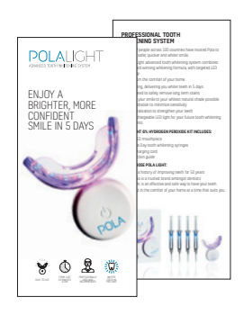
POLA LIGHT PATIENT HANDOUT Reorder M100513