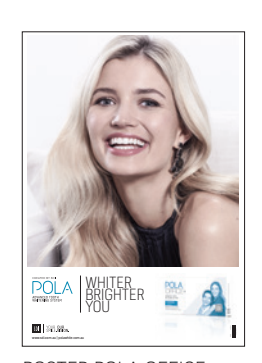
POSTER POLA OFFICE+ Reorder M100276