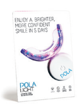
POLA LIGHT STAND Reorder M100505