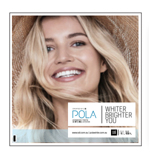
POLA CEILING TILE Reorder M100293