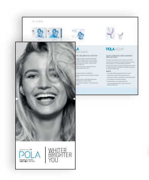
POLA PATIENT HANDOUTS Reorder M100298