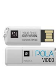
POLA WAITING ROOM USB VIDEO Reorder M100245