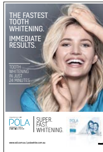
POSTER POLA RAPID Reorder M100568