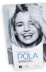
POLA PATIENT HANDOUT STAND Reorder M100290