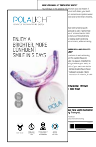
POLA LIGHT PATIENT HANDOUT Reorder M100510