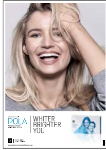
POSTER POLA NIGHT Reorder M100275