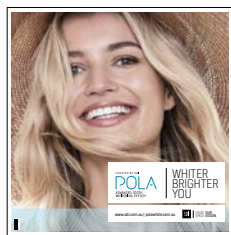
POLA CEILING TILE Reorder M100293