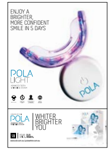
POSTER POLA LIGHT Reorder M100486