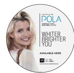
POLA WINDOW STICKER Reorder M100289