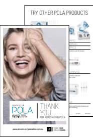
POLA THANK YOU CARD Reorder M100295