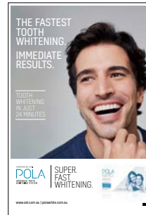
POSTER POLA RAPID Reorder M100569