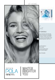
POLA PATIENT HANDOUTS Reorder M100367