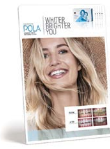
POLA BEFORE & AFTER STAND Reorder M100288