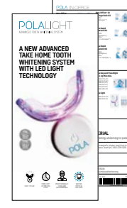
POLA LIGHT DENTIST HANDOUT Reorder M100509