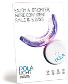
POLA LIGHT COUNTER CARD Reorder M100496