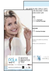
POLA MENU Reorder M100645