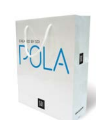
POLA CARRY BAG Reorder M100143