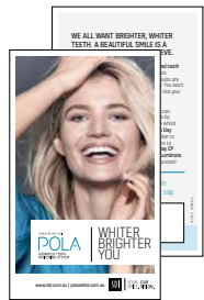
POLA STATEMENT STUFFER Reorder M100291