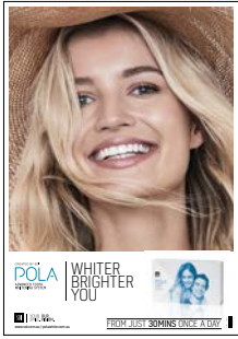
POSTER POLA DAY Reorder M100274

MARKETING MATERIAL TO ASSIST IN PROMOTING WHITENING TO PATIENTS.