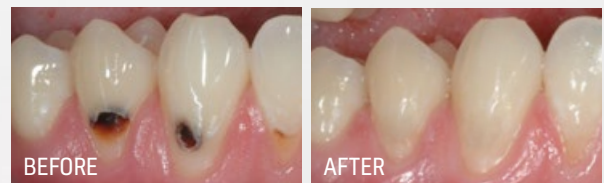
Riva Light Cure HV.