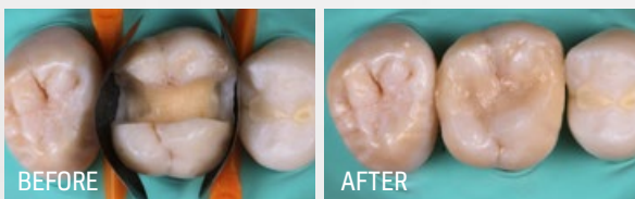
Brazil