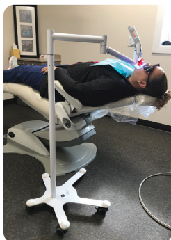
Pola Stand with Radii Xpert Light