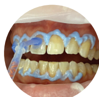
Unique application tip