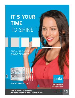
POSTER POLADAY Reorder M100274