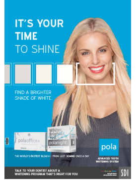
POSTER POLAOFFICE+ AND POLANIGHT Reorder M100281