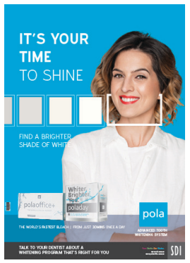
POSTER POLAOFFICE+ AND POLADAY Reorder M100279