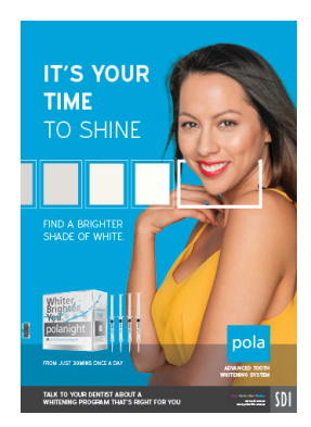
POSTER POLANIGHT Reorder M100275