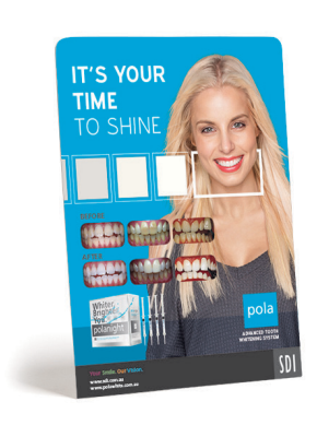
POLA BEFORE & AFTER STAND