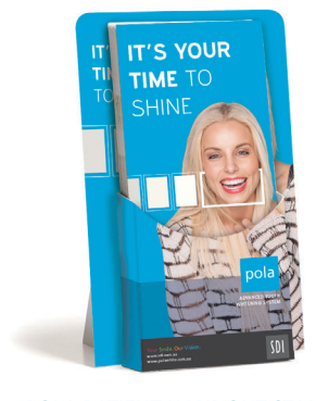
POLA PATIENT HANDOUT STAND