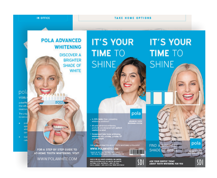
POLA PATIENT HANDOUTS Reorder M100283