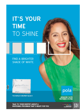
POSTER POLAOFFICE+ Reorder M100276