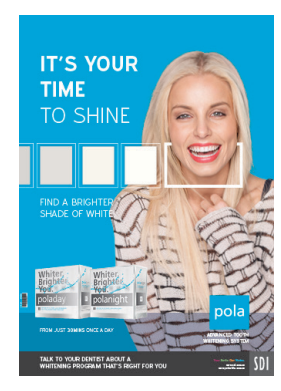
POSTER POLADAY AND POLANIGHT Reorder M100280