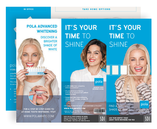
POLA PATIENT HANDOUTS Reorder M100298