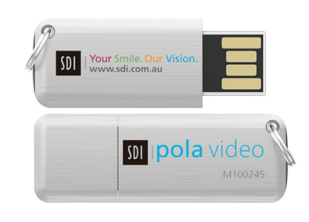
POLA WAITING ROOM USB VIDEO