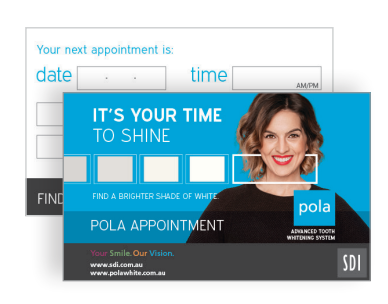
POLA APPOINTMENT CARD Reorder M100287