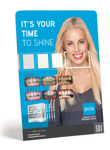
POLA BEFORE & AFTER STAND Reorder M100288