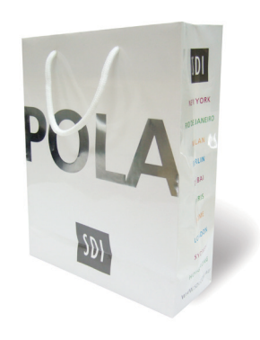
POLA CARRY BAG Reorder M100143