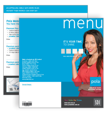
POLA MENU Reorder M100292