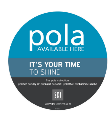
POLA WINDOW STICKER