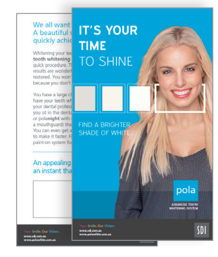
POLA STATEMENT STUFFER Reorder M100291