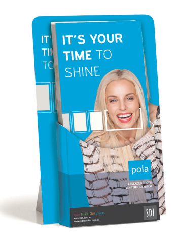
POLA PATIENT HANDOUT STAND Reorder M100290