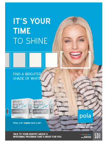
POSTER POLADAY AND POLANIGHT Reorder M100280