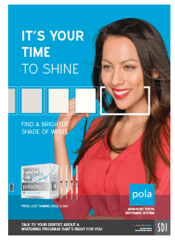
POSTER POLADAY Reorder M100274

MARKETING MATERIALS TO ASSIST IN PROMOTING WHITENING TO PATIENTS.