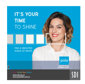
POLA CEILING TILE Reorder M100293

MARKETING MATERIALS TO ASSIST IN PROMOTING WHITENING TO PATIENTS.