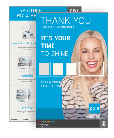
POLA THANK YOU CARD Reorder M100295